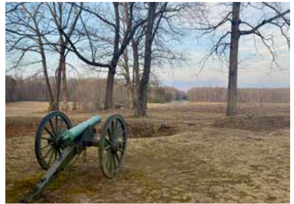
Preserved Confederate entrenchments at Saunders Field, Wilderness Battlefield

Grant told New York Times reporter that he could relate this message to President Lincoln: “Whatever happens, there will be no turning back.” ■