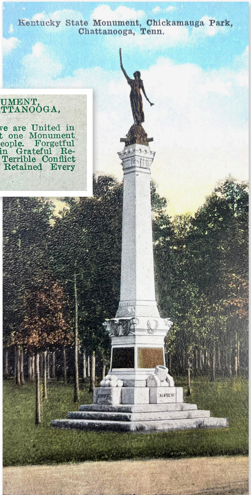
Kentucky State Monument, Chickamauga Park, Chattanooga, Tenn.